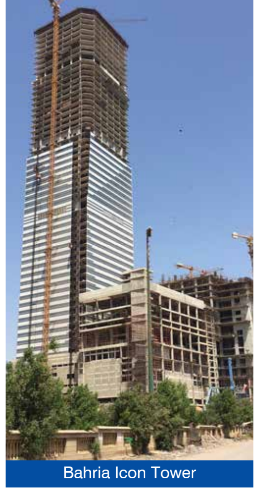
Bahria Icon Tower